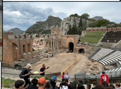
Greek amphitheater still in use today