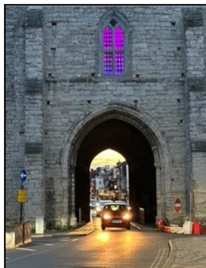
Old city wall now doubles as a Pub, restaurant, and Escape Room.