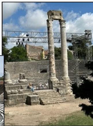
Roman amphitheater in Arles, France