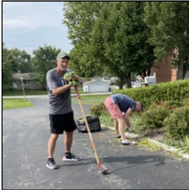
Parish Action Day on August 5