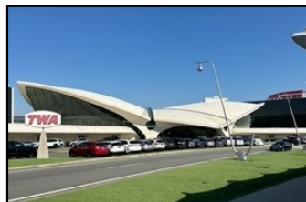
The old TWA Terminal renewed as a retro-styled hotel at JFK airport.